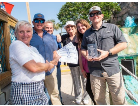
Round 2 Winners, St Johns County Sheriff's Office

Round 1 Winners and Grand Champions The "Flamingos" from Harbour Island from Covenant Closing & Title Services