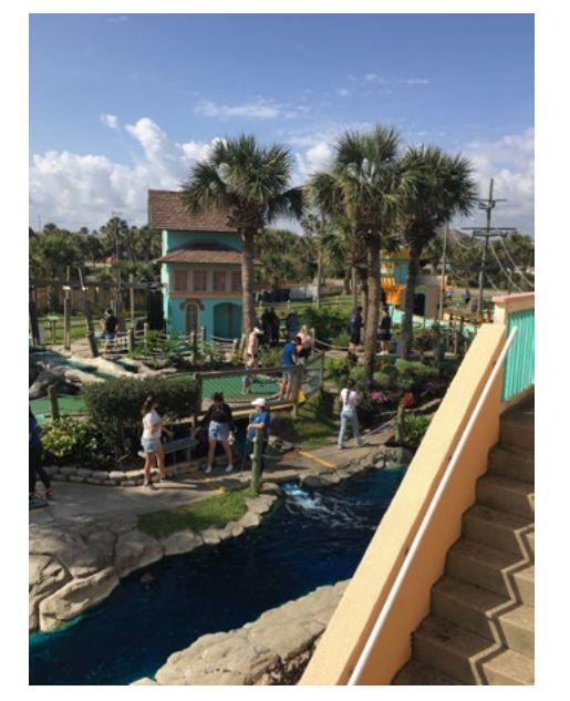
A beautiful day for the Swing Into Action tournament at Fiesta Falls Miniature Golf

Ringhaver, local business owners and longtime advocates for the needs of those facing homelessness.